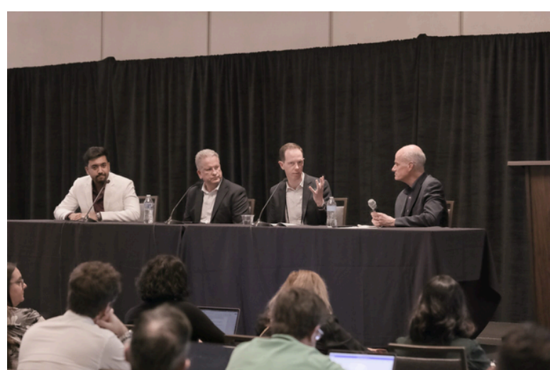
Panelists discuss the challenges of agentic AI and how the industry is starting to answer some of the questions